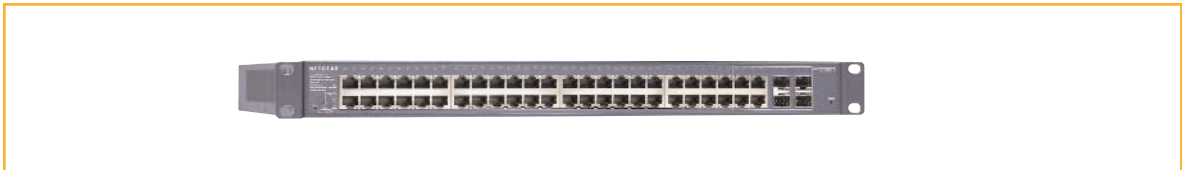
Figure 1. GS748TP ProSafe™ 48-port GE PoE Smart Switch

The NETGEAR ProSafe Smart switch family offers more in-depth features and functionality. This line of products is an example of NETGEAR's innovation and leadership in the networking market. The term smart refers to switches that are managed with a web based Graphic User Interface (GUI). Web GUI allows the administrator to log into the switch and configure advanced features, such as PoE, VLANs, and QoS. Designed to support the needs of growing SMB and mid-market companies, the ProSafe Smart Switches consist of the following line of products. The ProSafe Fast Ethernet Smart Switches with PoE are the FS726TP, FS728TP and the FS752TPS with 24 port and 48 ports. The ProSafe Gigabit Ethernet switches with PoE are the GS724TP and the GS748TP. Please use Figure 3 below to view PoE Power Budget to assist in number of PoE PD's these switches support.