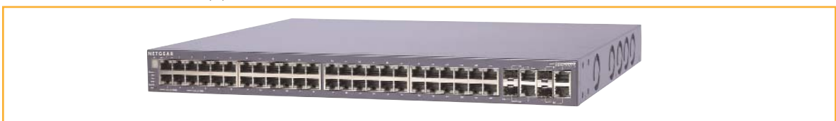
Figure 2. FSM7352PS ProSafe™ 48-Port 10/100 L3 Managed Stackable Switch

NETGEAR's ProSafe Managed Switches are fully managed switches. These switches are designed for deployments requiring more advanced features and functionality. This includes Layer 3 routing, Command Line Interface (CLI) and web GUI access, as well as full features and functionality including advanced QoS, VLANs, multicast support and security. The ProSafe Managed switch family with PoE support include the Fast Ethernet FSM7352PS ProSafe 48 Port 10/100 Managed Stackable switch, the FSM7328PS ProSafe 24 Port 10/100 Managed Stackable switch, and the FSM7326P ProSafe 24 Port 10/100 Managed switch. All switches support both Layer 3 and Layer 2 networking. Use Figure 3 to view PoE Power Budget to determine the number of PoE PD's these switches support.